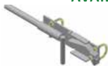
BARREL BOLT LATCH WITH STRYKER PLATE FOR SQUARE AND ROUND POSTS